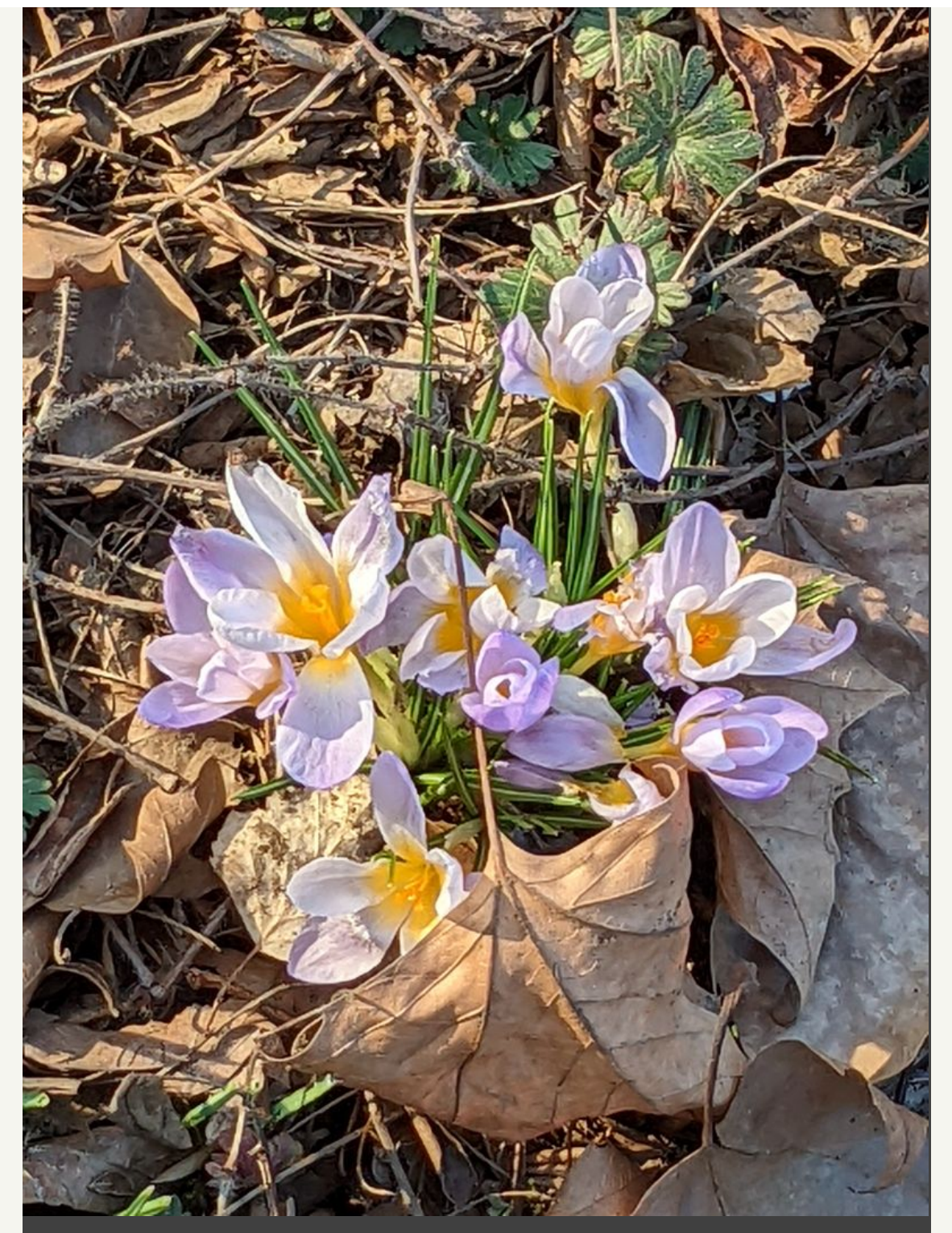
We hope you have been enjoying the sunshine of the last few days, even if the temperatures are still frigid. Still, signs of spring are popping up here and there. In some places more so than in others.